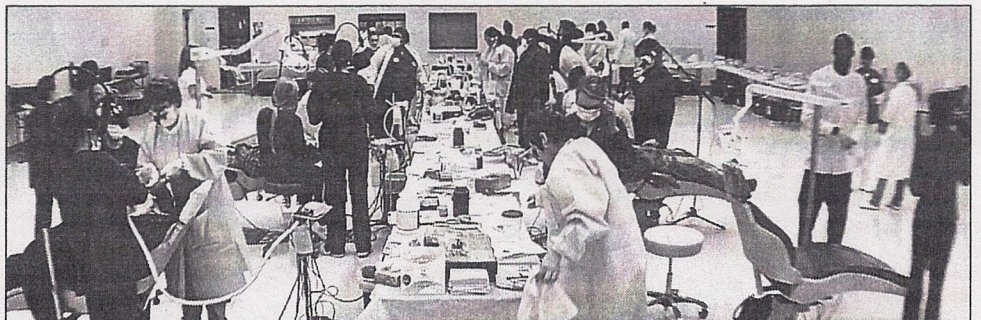
Ebenezer Baptist Church was transformed May 13 and 14 into a sprawling dental lab. The students are part of a two-year program at the Virginia Beach Technical Education Center.